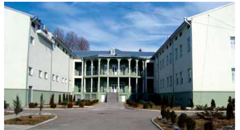
The Gori Military Hospital